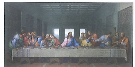
The Last Supper by Leonardo da Vinci in the Convent of Santa Maria delle Grazie

When Luke talks about 'disciples', he does not mean simply 'the Twelve Apostles'. When we listen to the Gospel, we might keep this wider meaning in mind – and include ourselves among the disciples. ■